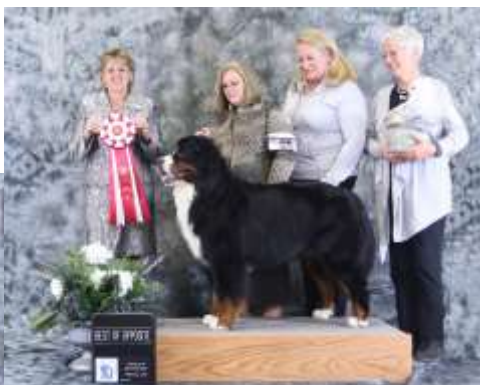
BOS Day 1