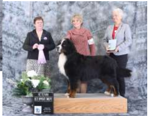
BOS Veteran Sweeps Day 2