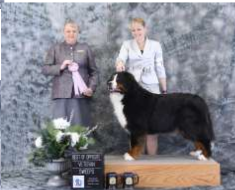
BOS Veteran Sweeps Day 1