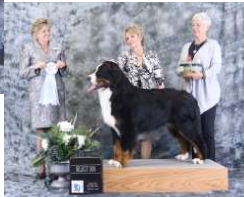
Select Dog Day 1