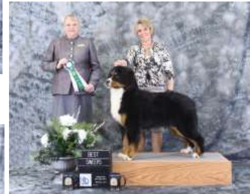
Best Puppy Sweeps Day 1