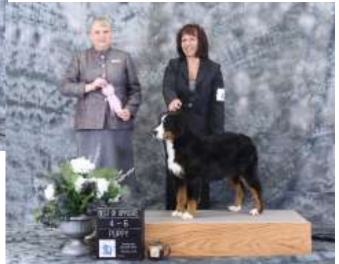
BOS 4-6 Puppy Day 1