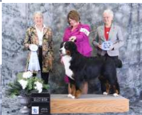
Select Bitch Day 2