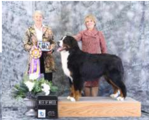
BOB Day 2