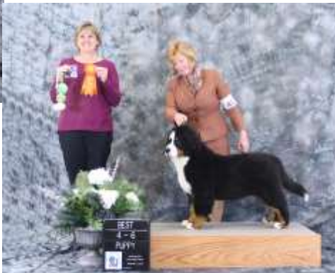
Best 4-6 Puppy Day 2