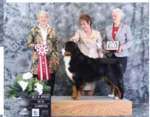
BOS Day 2