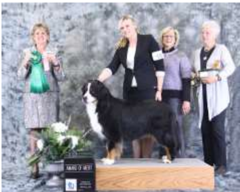
BOB Day 1