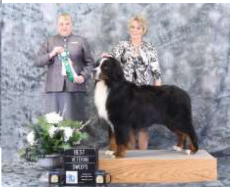
Best Veteran Sweeps Day 1