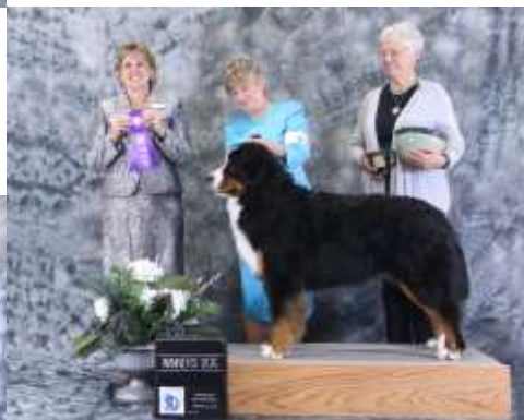
WD Day 1