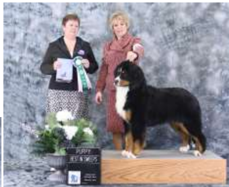
Best Puppy Sweeps Day 2