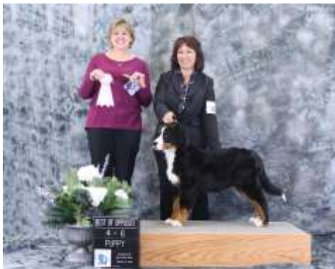
BOS 4-6 Puppy Day 2