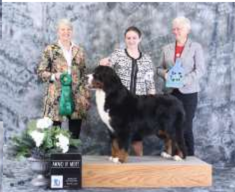
AOM2 Day 1