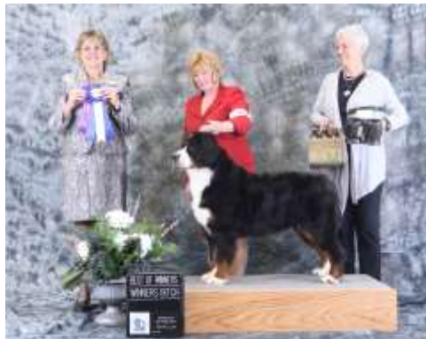
BOW, WB Day