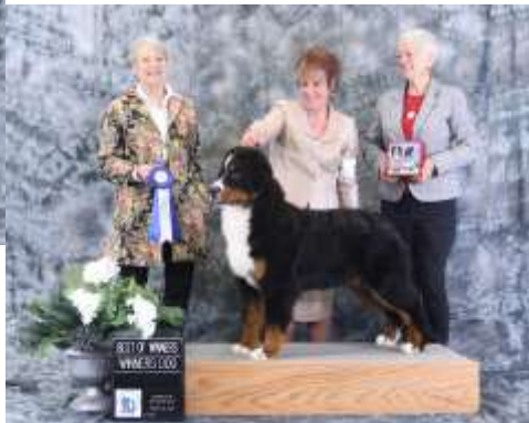
BOW, WB Day 2