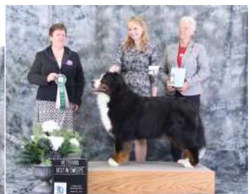
Best Veteran Sweeps Day 2