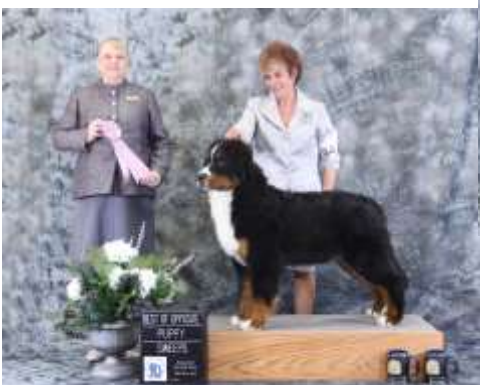
BOS Puppy Sweeps Day 1