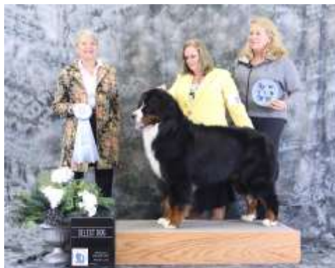
Select Dog Day 2