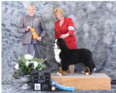
Best 4-6 Puppy Day 1