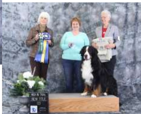
High in Trial Day 2