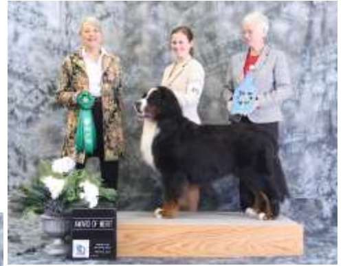
AOM Day 2