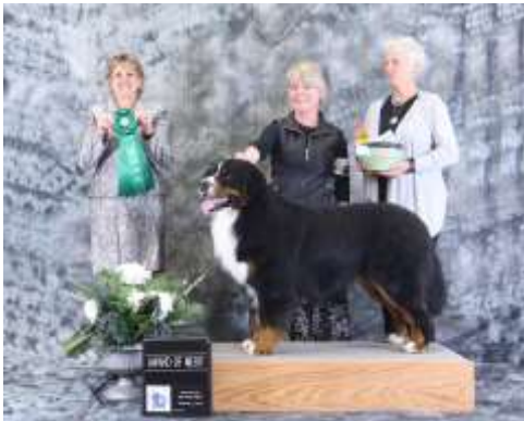
AOM Day 1