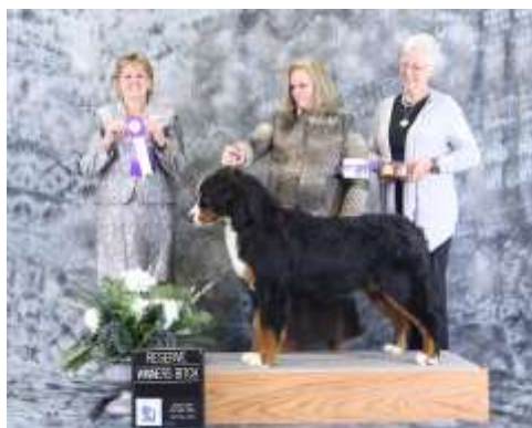
RWB Day 1