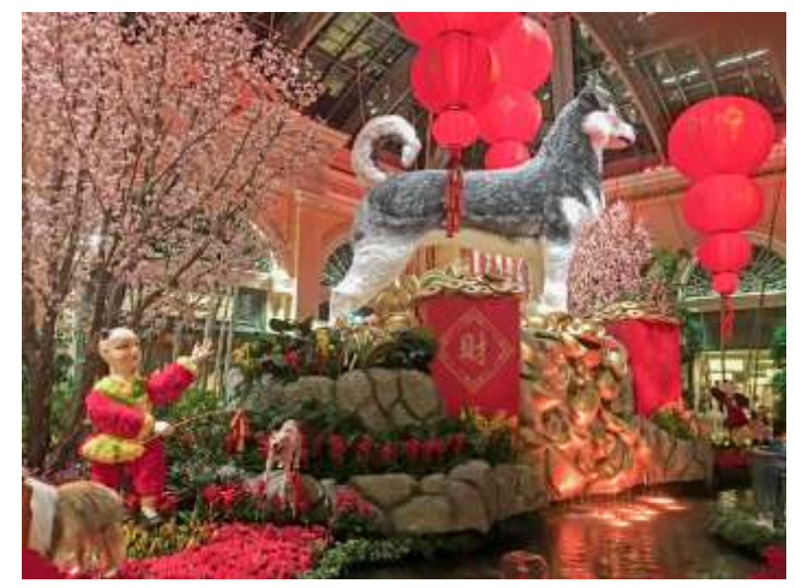
Year of the Dog display; Bellagio Hotel, Las Vegas, NV This is a Year of Earth Dog, starting from the 2018 <u>Chinese</u> New Year on Feb. 16 and lasting to 2019 Lunar New Year's Eve on Feb. 4.

Chinese New Year, also known as the Spring Festival in modern China, and one of the Lunar New Years in Asia, is an important Chinese festival celebrated at the turn of the traditional lunisolar Chinese calendar. Celebrations traditionally run from the evening preceding the first day, to the Lantern Festival on the 15th day of the first calendar month. The first day of the New Year falls on the new moon between the 21st of January and 20th of February. In 2018, the first day of the Lunar New Year was on Friday, 16 February, initiating the year of the Dog.