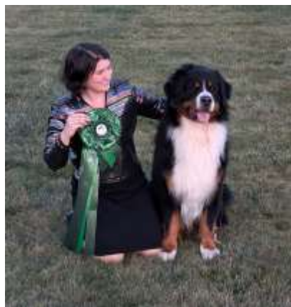
GCH CH Highlands Road less Traveled V Gusto RN

Hiker had a great weekend at the Illinois Regional Specialty at the end of October, on the 2 days we were able to show.